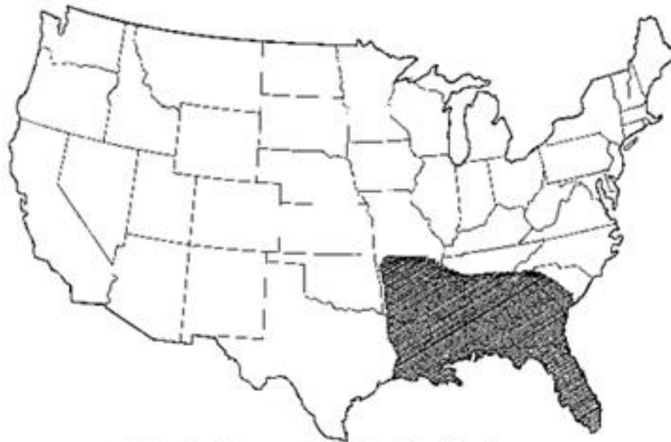
Historic Range of the Florida Panther