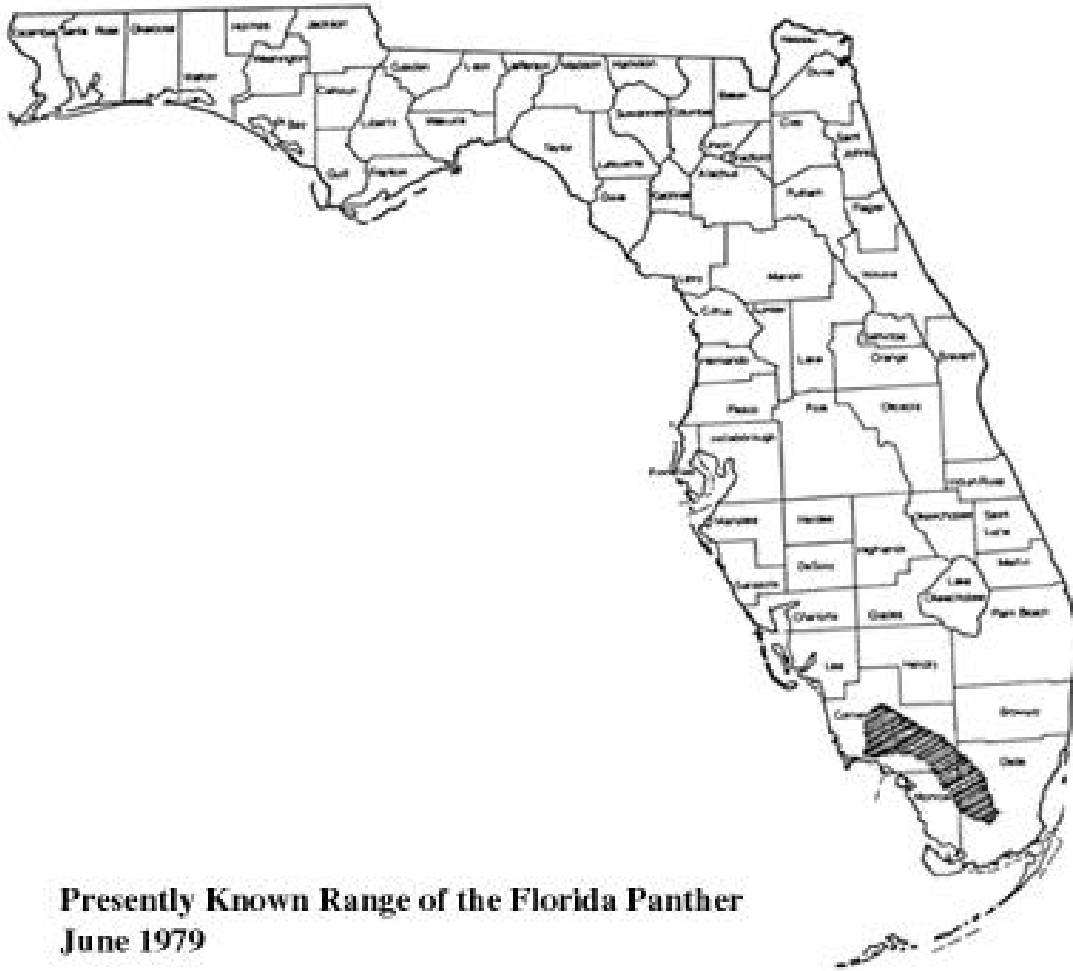
Figure 2. Area where consistent documented evidence of the presence of panthers occurs.