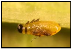
Photo of Lilioceris sp. larva, a beetle obtained from Nepal, and if released, will target air potato in Florida

In 2008, the host range testing of Lilioceris sp., a leaf beetle discovered in Nepal as a candidate biocontrol agent for air potato ( Dioscorea bulbifera ), was completed. This research, which began in 2005 by the USDA-ARS, demonstrated the beetle's host range is exceptionally narrow. It can develop only on air potato. This research also showed that a single beetle can consume, on average, almost three square meters of leaves during its life (almost one square meter during its larval development). Taxonomists have been unable to give the beetle a name other than Lilioceris near impressa , but research is underway to identify or describe the species. This beetle has just been petitioned to the USDA-APHIS (TAG) for review, the first step in obtaining permission from the USDA-APHIS for its release in Florida (the TAG review and USDA-APHIS permit process can be up to two years).