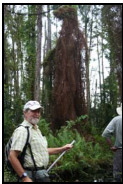
Dr. Bob Pemberton, a USDA-ARS scientist, surveying the damage caused by the Neomusotima moth at Jonathan Dickinson Park during the fall of 2008

At the University of Florida, research is looking into the effects of prescribed fire, after aerial herbicide treatment on reducing L. microphyllum and increasing native plant cover on tree islands at A.R.M. Loxahatchee NWR. The use of herbicide and prescribed fire on Everglade's tree islands resulted in a complete change in the structure and composition , at least temporarily, of the islands. Initial observations at