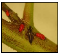
Photo of thrips nymphs and adults found on a Brazilian pepper stem.

Complicating matters in finding suitable biological control candidates in South America is the discovery that two different Brazilian pepper haplotypes were introduced into Florida (plant haplotype - a group of plant genes found in chloroplast DNA that change very slowly over time, are maternally inherited and are not subject to change during sexual reproduction). These two haplotypes have since extensively hybridized and that the vast majority of plants in Florida are now hybrids. The same hybrids are not known to occur in South America due to the allopatric distribution of the source populations. These subtle but quantifiable molecular differences have been shown to impact insect feeding preferences, growth, and survival in some species. Although morphologically indistinguishable to humans, insects show a distinct preference and improved performance for one haplotype over another. There are at least fourteen different Brazilian pepper haplotypes in South America according to research from Texas Christian University. Given this genetic landscape, a thrips species collected from one of the two haplotypes that occurs in Florida, and compatible with the Brazilian pepper plants that infest Florida, has been located and has been colonized in quarantine by the USDA-ARS. This species, though morphologically similar to the thrips species tested previously by the University of Florida, is different and is now undergoing testing in USDA-ARS quarantine to determine suitability for