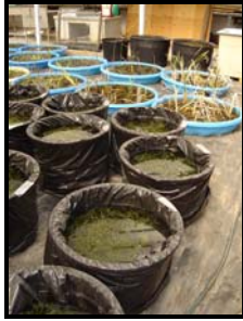
Aquatic herbicide testing at UF's Center for Aquatic and Invasive Plants