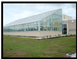
The quarantine facility at the USDA-ARS Invasive Plant Research Laboratory in Ft. Lauderdale, Florida