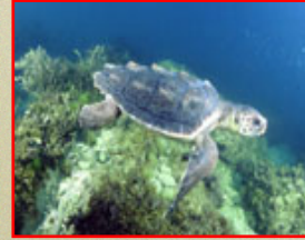
Loggerhead turtle ( Caretta caretta )

Public Hearing Document- prohibit reef fish longline gear east of Cape San Blas, inside the 35 fathom boundary during June-August